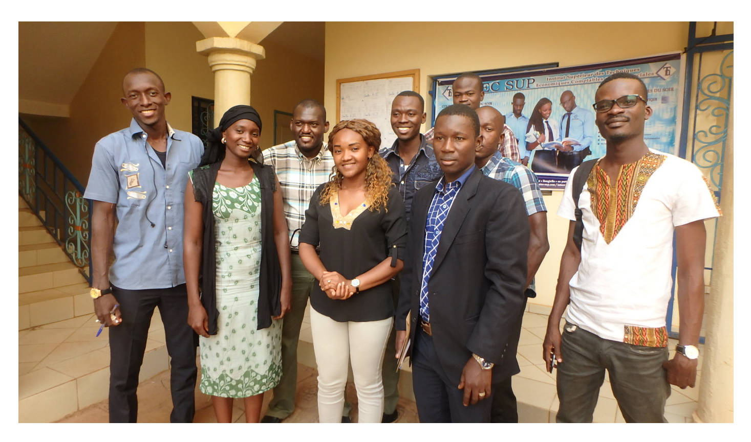
How to manage a nascent association in Africa?

From setting-up to promotion, in fundraising. A week of reflection to leave on good fondations.