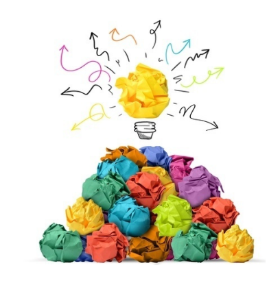
Ideas for action